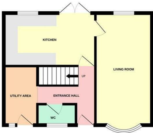
GROUND FLOOR 420 sq.ft. (39.0 sq.m.) approx.