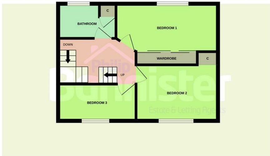
1ST FLOOR 409 sq.ft. (38.0 sq.m.) approx.