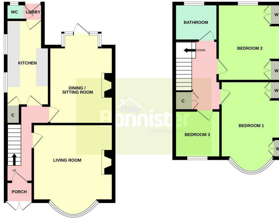
1ST FLOOR 452 sq.ft. (42.0 sq.m.) approx.

TOTAL FLOOR AREA: 946 sq.ft. (87.9 sq.m.) approx.