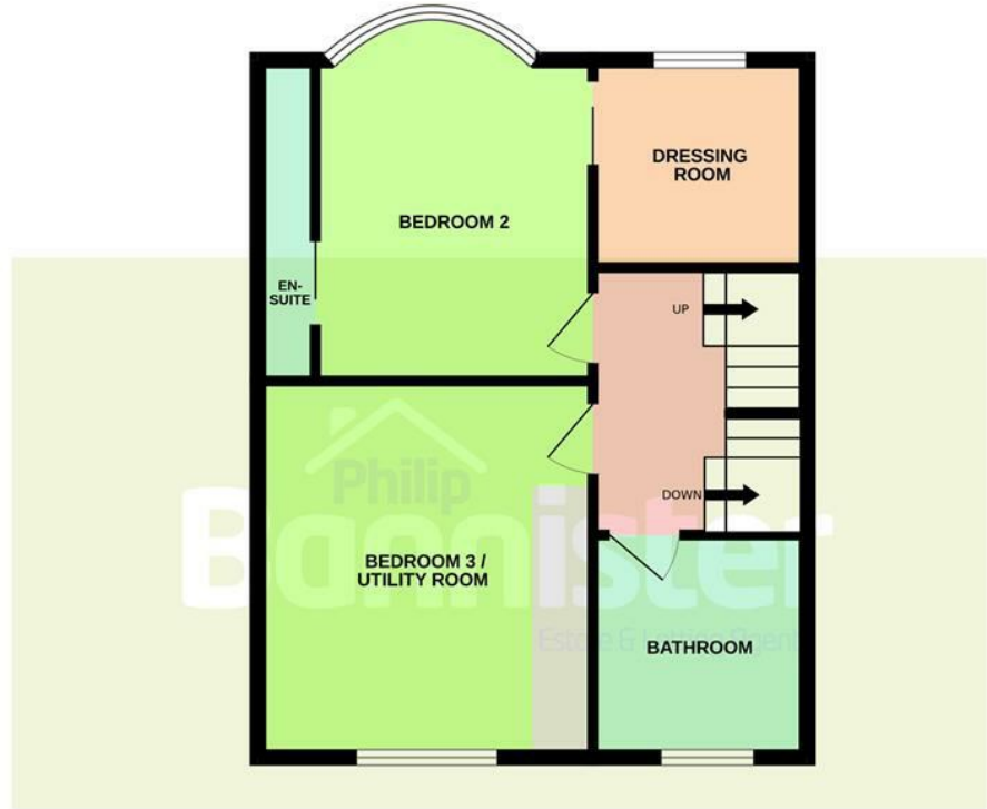
1ST FLOOR 497 sq.ft. (46.2 sq.m.) approx.