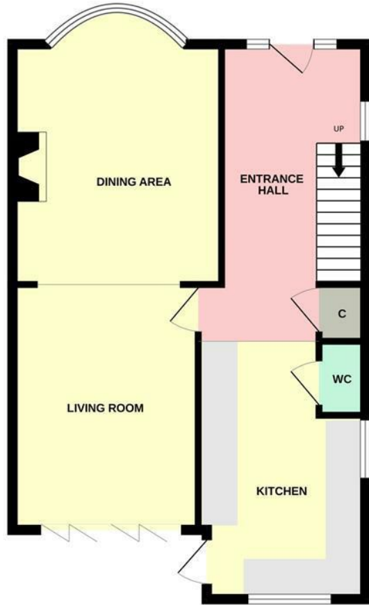
GROUND FLOOR 601 sq.ft. (55.9 sq.m.) approx.