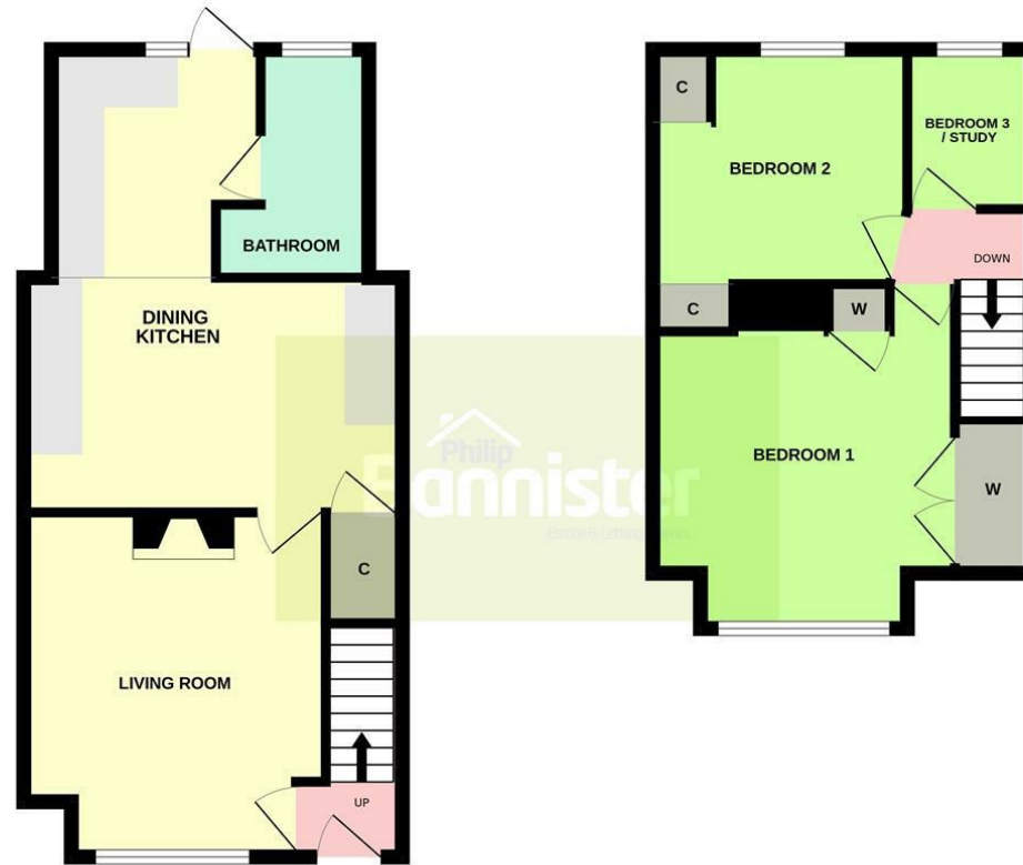
1ST FLOOR 317 sq.ft. (29.4 sq.m.) approx.

TOTAL FLOOR AREA: 756 sq.ft. (70.2 sq.m.) approx.