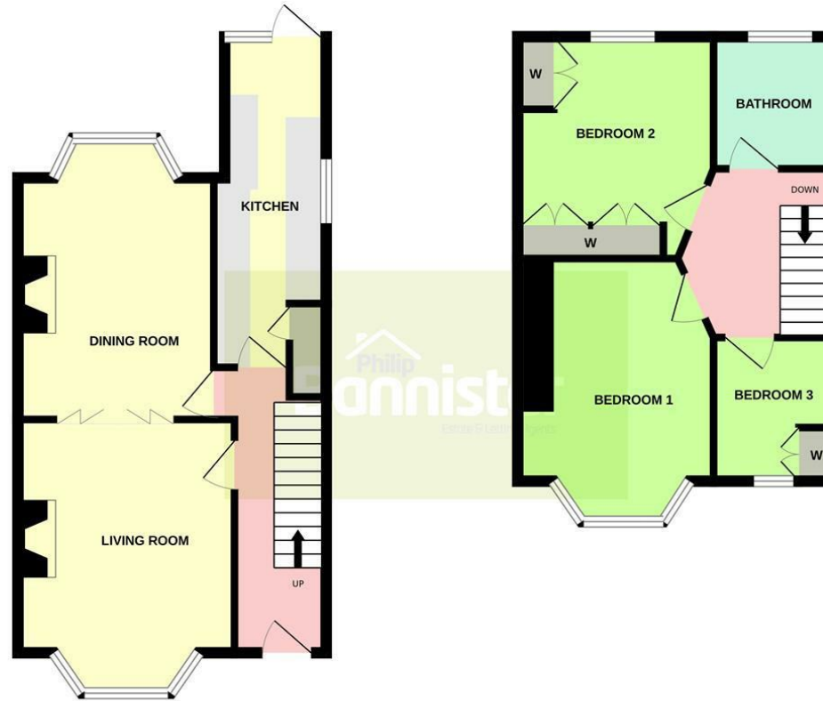
1ST FLOOR 370 sq.ft. (34.4 sq.m.) approx.

TOTAL FLOOR AREA: 804 sq.ft. (74.7 sq.m.) approx.