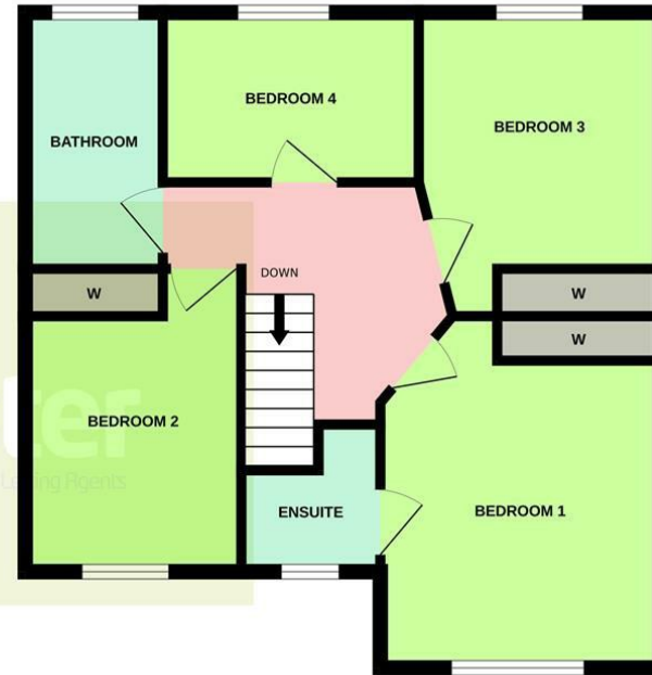
1ST FLOOR 559 sq.ft. (51.9 sq.m.) approx.