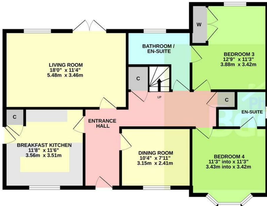
1ST FLOOR 577 sq.ft. (53.6 sq.m.) approx.