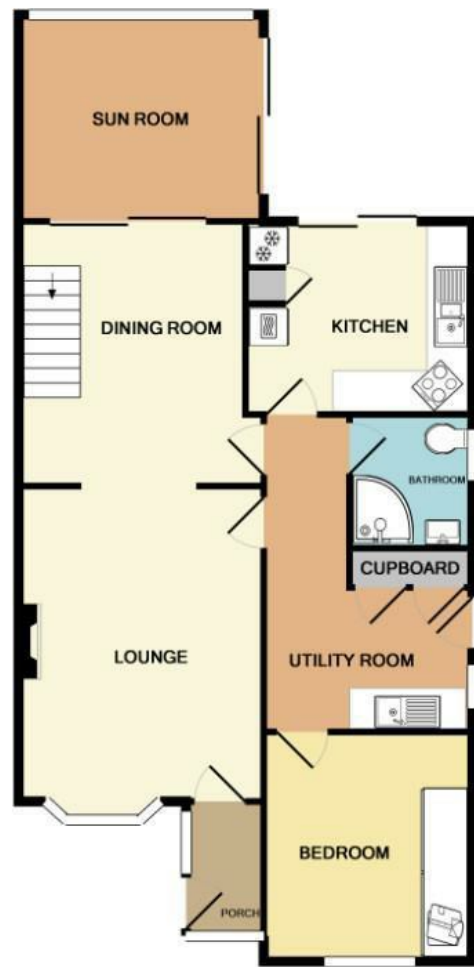
GROUND FLOOR APPROX. FLOOR AREA 848 SQ.FT. (78.8 SQ.M.)