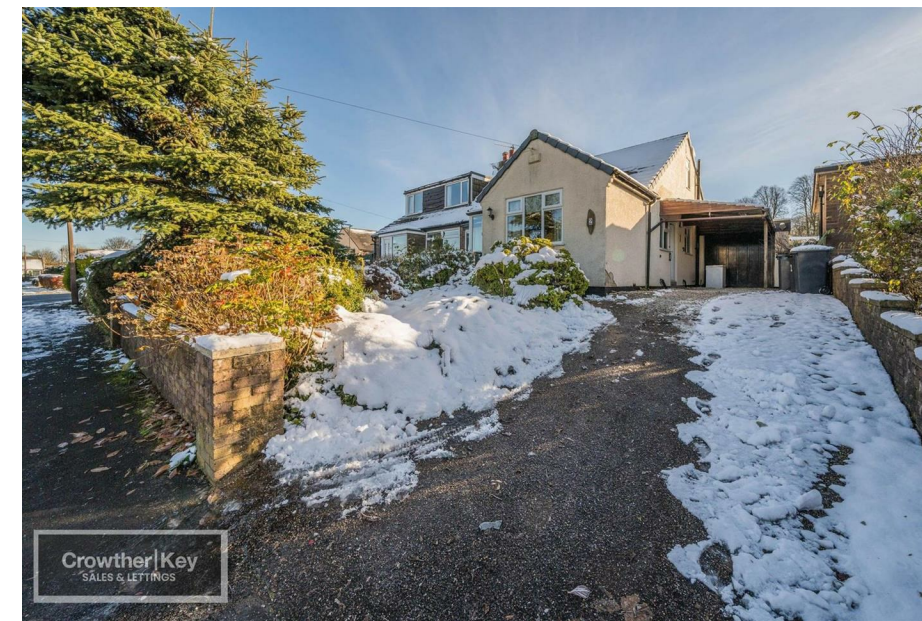
Crowther|Key SALES & LETTINGS