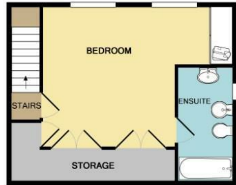
1ST FLOOR APPROX. FLOOR AREA 383 SQ.FT. (35.6 SQ.M.)

TOTAL APPROX. FLOOR AREA 1232 SQ.FT. (114.4 SQ.M.)