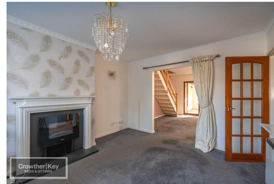
Crowther|Key SALES & LETTINGS