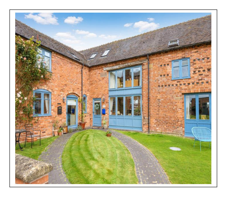
The Oaks, 4 Old Hall Court, High Offley, Stafford

red for the exclusive use of Barbers Estate Agents. All due care has been taken in the preparation of this floor nsions of rooms and walls are approximate. The positioning of windows, doors, openings, fixture and fittings. This floor plan is not, nor should it be taken as, a true and oxact representation of the subject proper Plan produced using Plant in