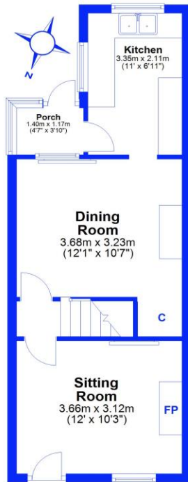
Ground Floor Approx. 34.1 sq. metres (367.4 sq. feet)