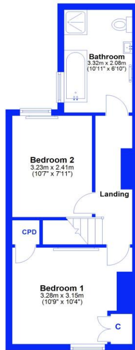
First Floor Approx. 34.1 sq. metres (367.4 sq. feet)