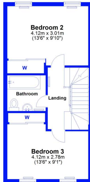
First Floor Approx. 36.2 sq. metres (389.9 sq. feet)