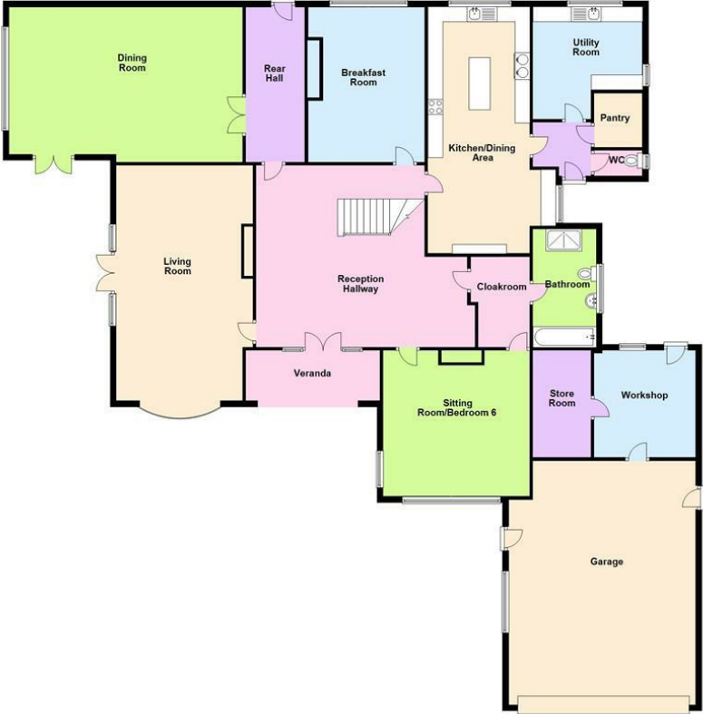
Total area: approx. 493.2 sq. metres (5308.3 sq. feet)