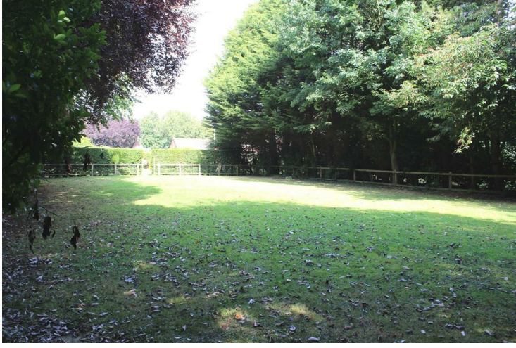
Small area of amenity grassland.