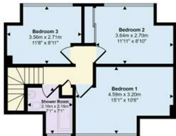
First Floor Approx 42 sq m / 453 sq ft

This floorplan is only for illustrative purposes and is not to scale. Measurements of rooms, doors, windows, and any items are approximate.