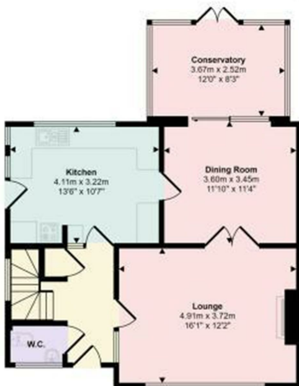
Ground Floor Approx 64 sq m / 693 sq ft

Approx Gross Internal Area 108 sq m / 1146 sq ft