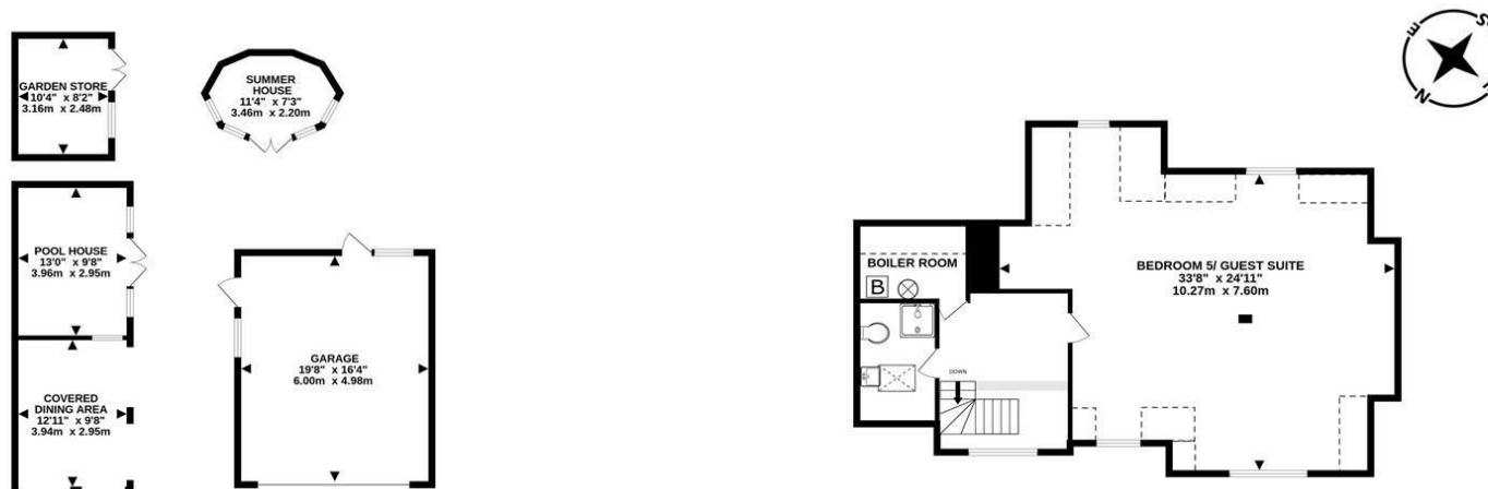
GARAGE AND OUTBUILDINGS