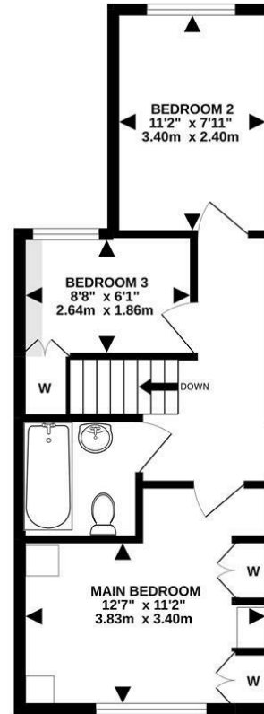
1ST FLOOR 384 sq.ft. (35.7 sq.m.) approx.

TOTAL FLOOR AREA: 818 sq.ft. (76.0 sq.m.) approx. Measurements are approximate. Not to scale. Illustrative purposes only. Made with Metropix ©2022