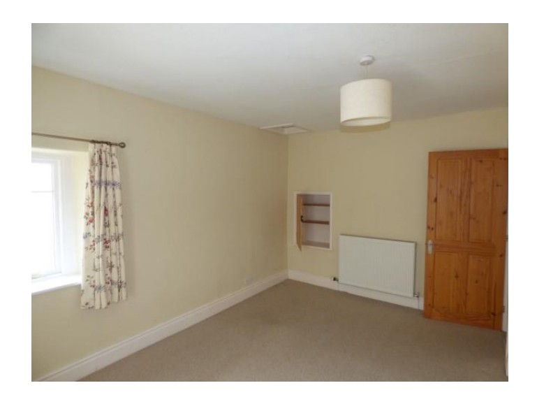
Bedroom 2: 9'5" x 5'9" (2.87 x 1.75) Single bedroom, double glazed window and radiator.