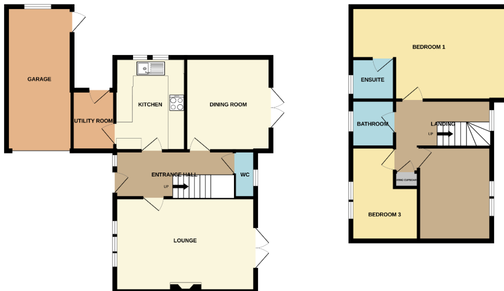
1ST FLOOR 521 sq.ft. (48.4 sq.m.) approx.

TOTAL FLOOR AREA: 1221 sq.ft. (113.5 sq.m.) approx.