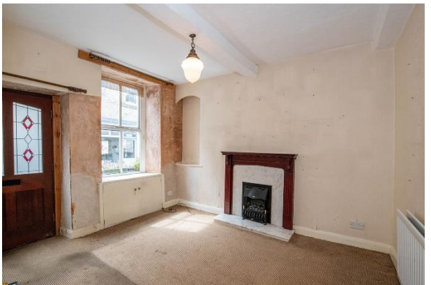
Dining Room: 8'0" x 10'11" (2.43 x 3.32) Double glazed timber window, radiator.

Part glazed wood external entrance door, double glazed timber window, flame effect gas fire in wood fire surround with marble inset and hearth, radiator, encased beam ceiling.