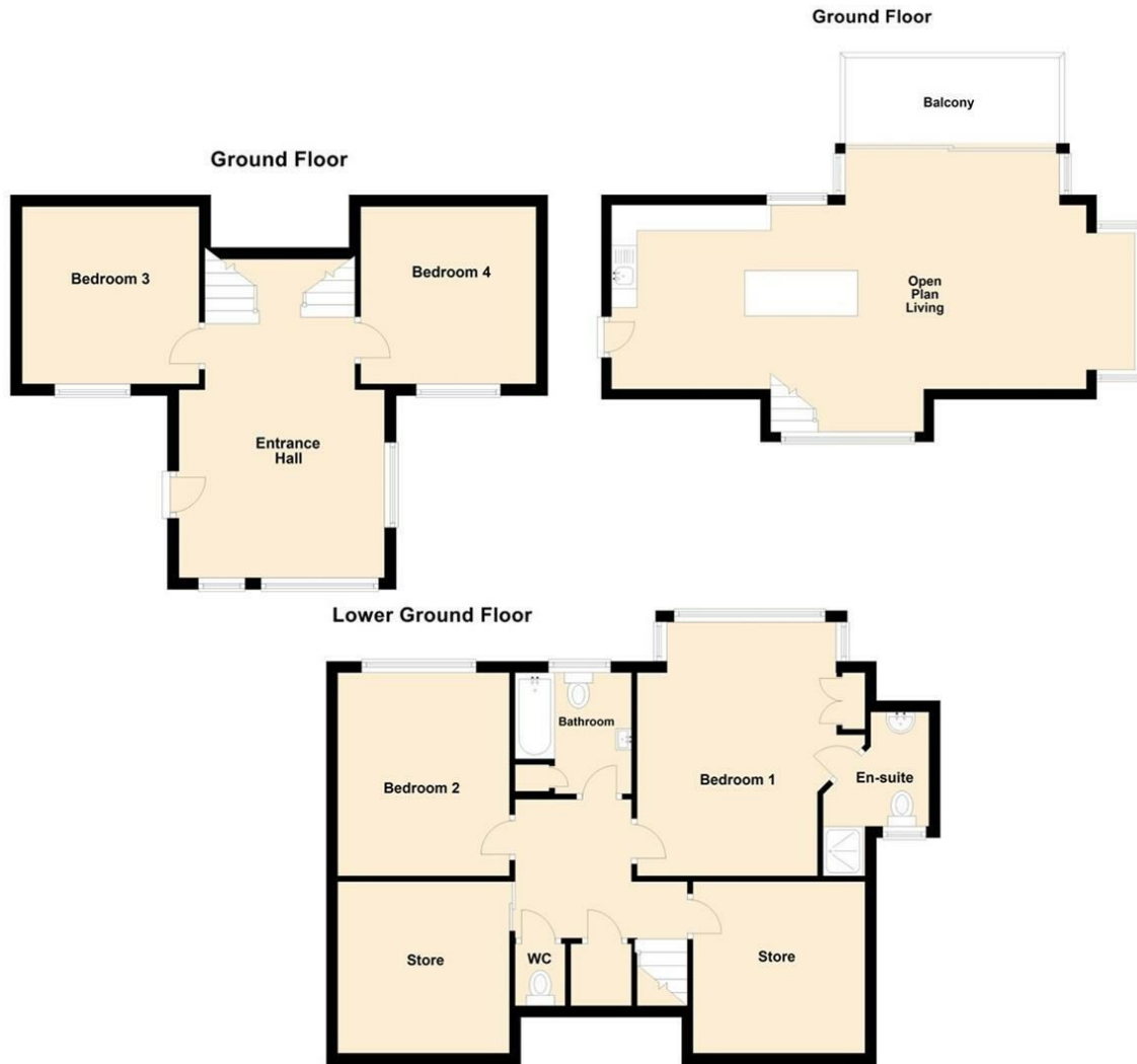
Floorplans are not to scale and for guidance only