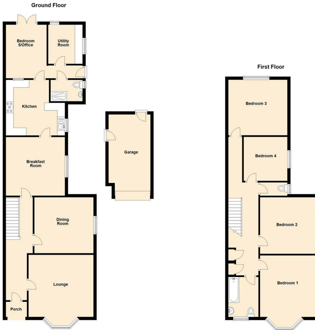
Floorplans are not to scale and for guidance only