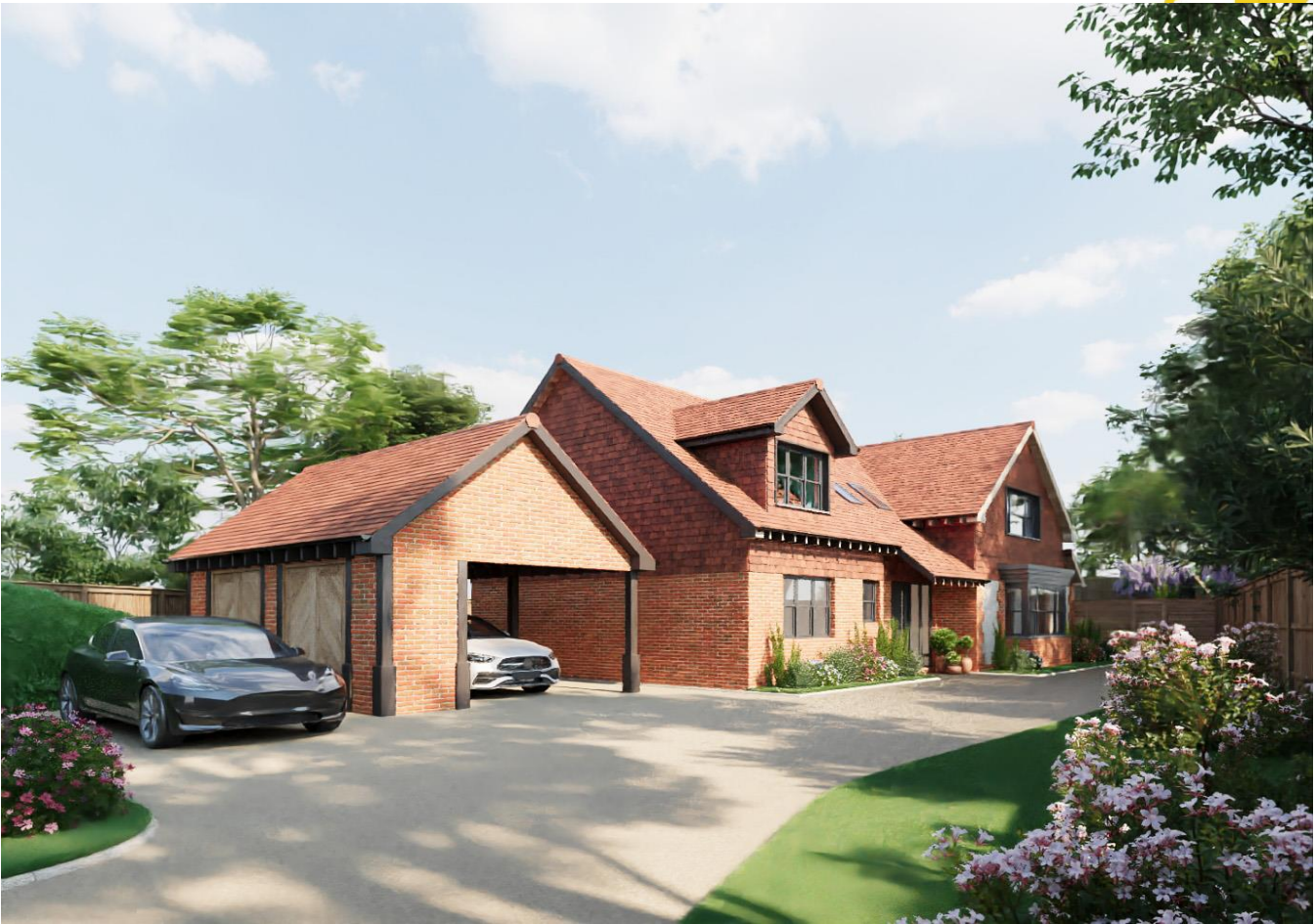
Exciting Development Opportunity – Full Planning Approved for Executive Five Bedroom Home

A rare chance presents itself to acquire a generous plot of land extending to approximately 0.32 acres, nestled in a quiet and sought-after location just off Toddington Lane.