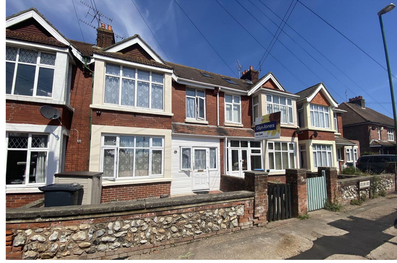
Glyn Jones and Company are delighted to offer a rare opportunity to purchase this spacious older style terraced house situated within a popular road.

The accommodation comprises; an entrance porch leading into a hallway, two reception rooms, a modern fitted kitchen, three bedrooms, a bathroom and a garden room