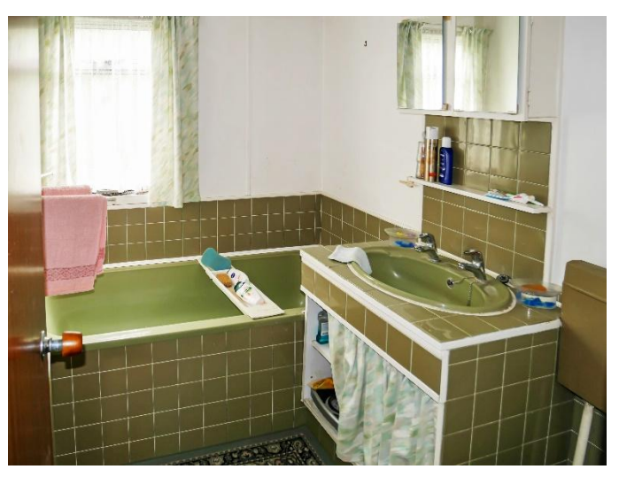
Council Tax Band – A Energy Efficiency Rating – N/A

Tenure: Permission to place a park home on a designated site is by written agreement, in accordance with the 1983 Act. The permitted length of the agreement can vary from site to site, and we therefore strongly recommend that you engage legal representation before committed to the purchase of a park home.