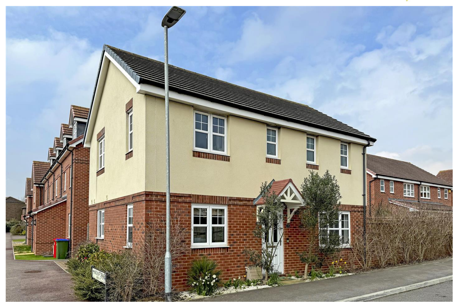
Glyn-Jones and Company are delighted to offer for sale this detached family house which offers bright and spacious accommodation throughout.

The accommodation comprises; an entrance hall, a triple aspect living room, a fitted kitchen/diner with an integral gas hob and electric oven and a door leading into a separate utility room with the boiler and a door to a cloakroom. To the first floor there are three bedrooms with an en-suite shower room to the master as well as an additional family bathroom. The property benefits from gas fired central heating and double glazing.