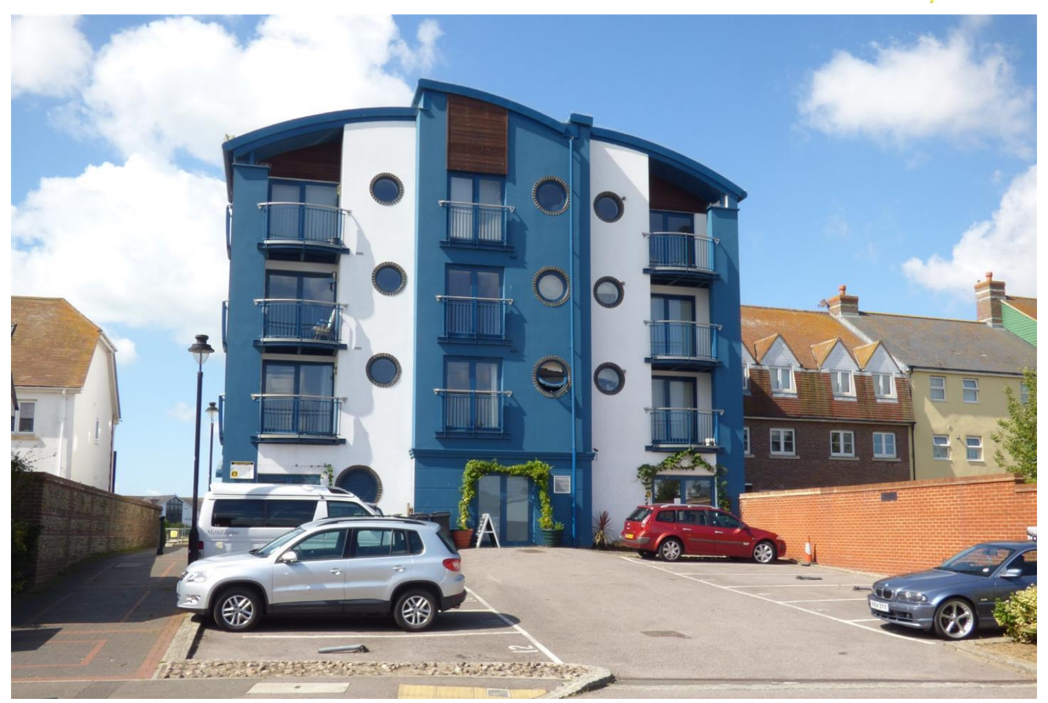
Glyn-Jones and Company are delighted to offer for sale this purpose built apartment situated on the first floor situated within this popular development along the riverside.

The accommodation comprises; an entrance hall with built in cupboard, a spacious lounge/diner with door to a BALCONY, a modern fitted kitchen with integrated hob, oven, dishwasher and washing machine, a double bedroom with built in wardrobes and Juliette balcony and a bathroom with shower over the bath. In our opinion, the property is presented in good clean decorative order throughout and benefits from electric heating, double glazing and the remainder of 125 year lease.