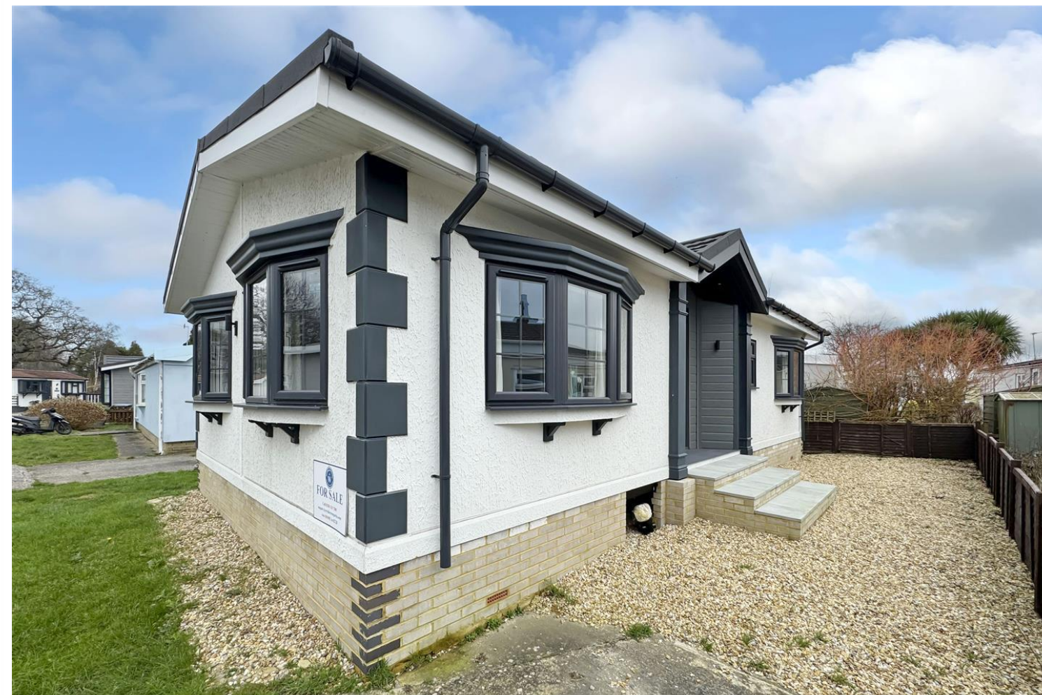
Glyn-Jones and Company are delighted to offer for sale this BRAND NEW 36' x 20' Willerby Hazelwood park home situated on a popular full residential site.

Littlehampton Office 01903 739000 littlehampton@glyn-jones.com