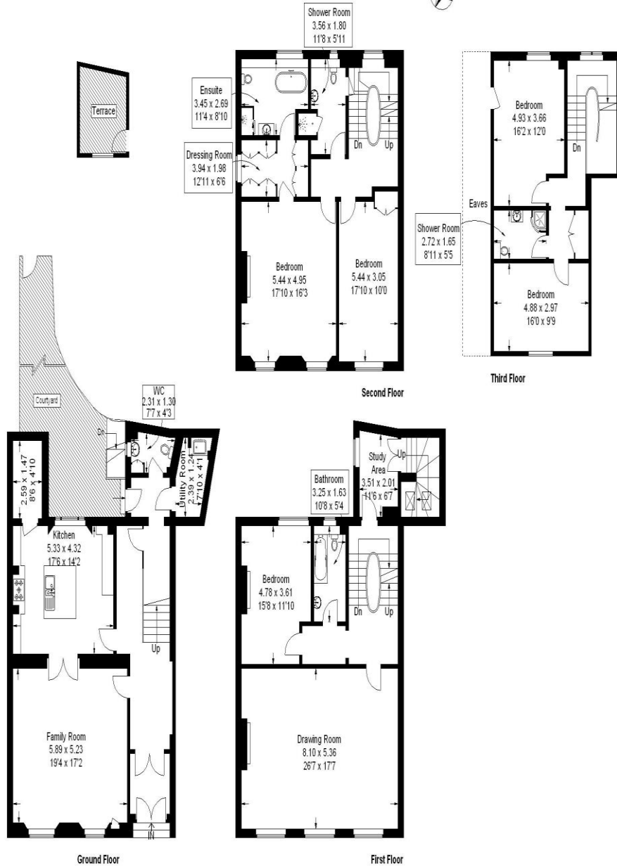
Illustration for identification purposes only, measurements are approximate, not to scale. (ID154532)

Southsea Sales & Lettings 7/9 Stanley Street, Southsea, PO5 2DS Tel: 023 9281 5221