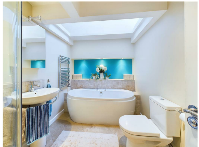
Bathroom 9'5" x 6'9"

Luxury bathroom with bath, walk-in shower, towel rail, WC, washbasin and recessed lighting. Limestone coloured tiled flooring.