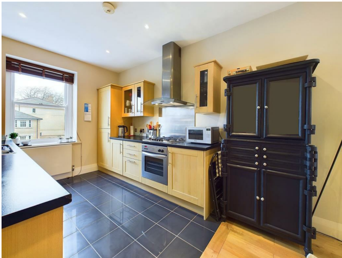
Open plan kitchen 8'7" x 10'5"

A good range of stylish units with integrated compliances including a slimline BEKO dishwasher, an AEG washing machine/dryer, a fridge/freezer and electric Stoves oven with gas hob. Wall-mounted Worcester combi boiler.