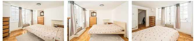
BEDROOM 10'9" x 14'1"