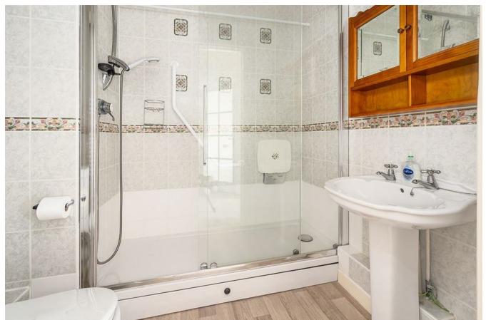
White suite comprising walk-in shower, Wash hand basin, Low level WC Electric heater towel rail, Extractor