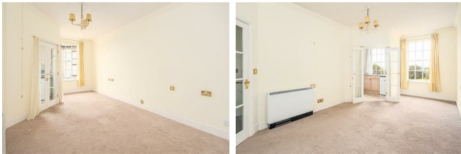
Electric storage heater Telephone point TV point Sash window to front elevation