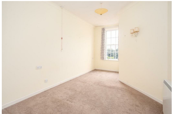
Sash window to front elevation Telephone Electric storage heater