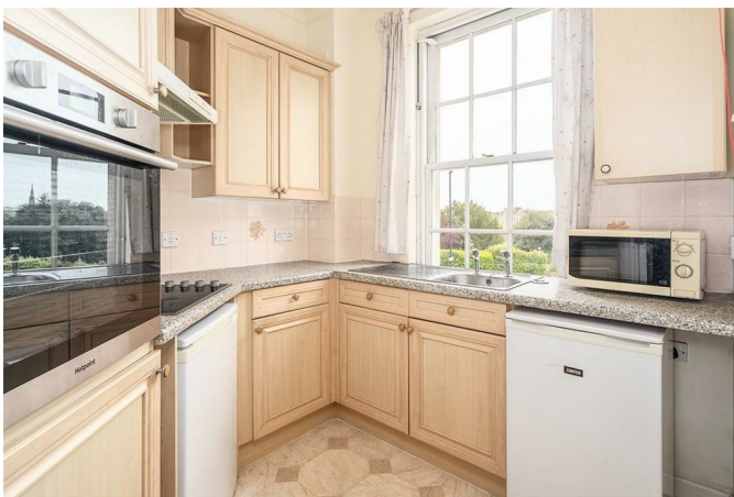
Range of wall and base cupboards with worktops over Four ring electric hob with extractor over Oven Separate under counter fridge and freezer Stainless steel sink with drainer and separate cold and hot taps