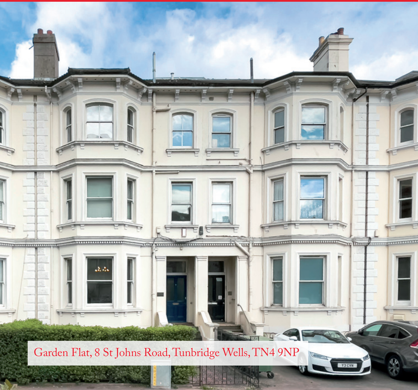
Garden Flat, 8 St Johns Road, Tunbridge Wells, TN4 9NP