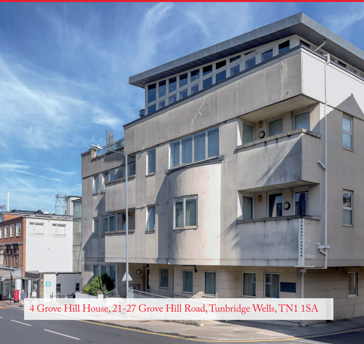
4 Grove Hill House, 21-27 Grove Hill Road, Tunbridge Wells, TN1 1SA