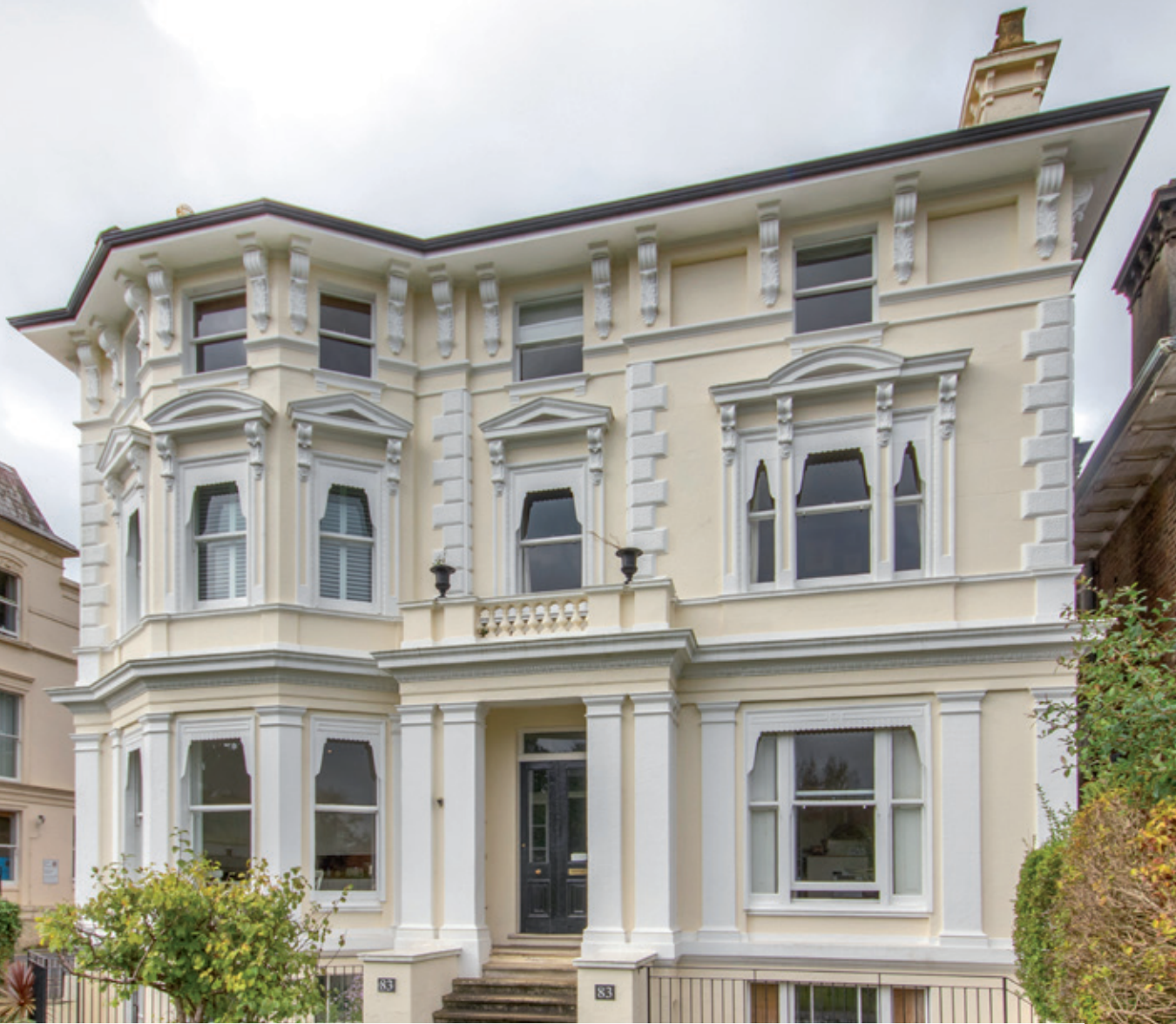
Flat 5, 83 Mount Ephraim, Tunbridge Wells, TN4 8BS