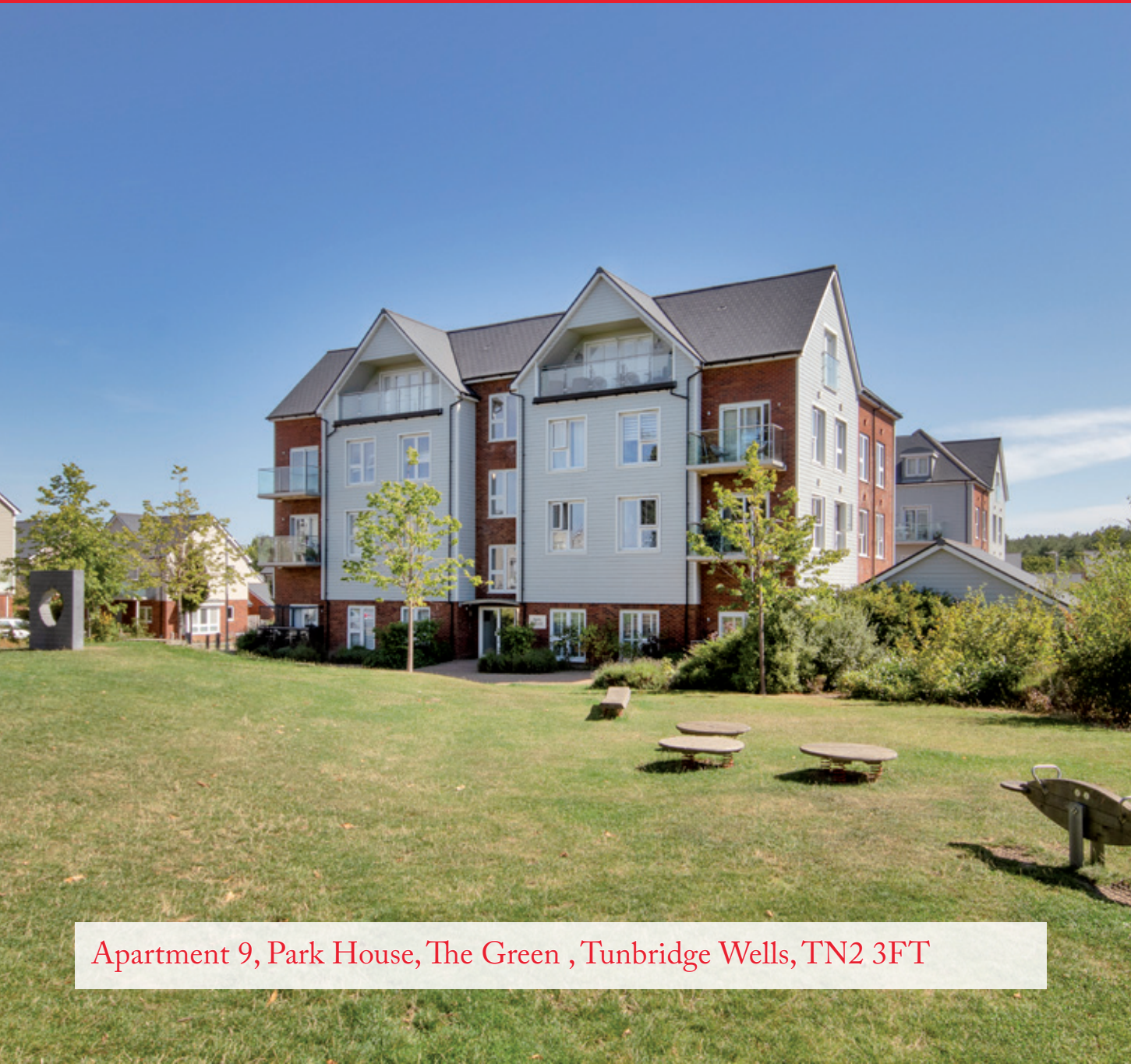
Apartment 9, Park House, The Green , Tunbridge Wells, TN2 3FT