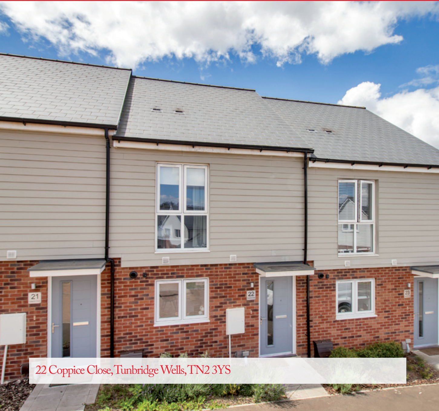
22 Coppice Close, Tunbridge Wells, TN2 3YS