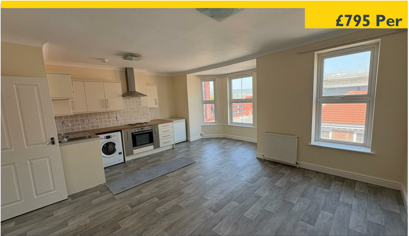
36 Flat B 36 Bouverie Square, , Folkestone CT20 1BA

Money laundering regulations - Intending purchasers will be asked to produce identification documentation at a later stage and we would ask for your co-operation in order that there will be no delay in agreeing the sale.