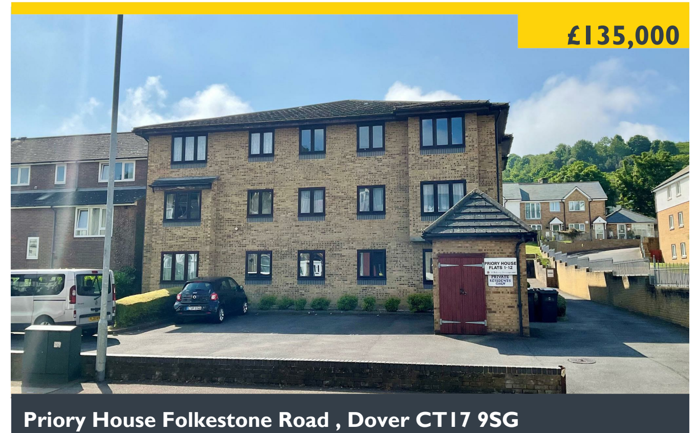
Priory House Folkestone Road , Dover CT17 9SG

www.tersons.com 29 Castle Street, Dover, Kent, CT16 IPT