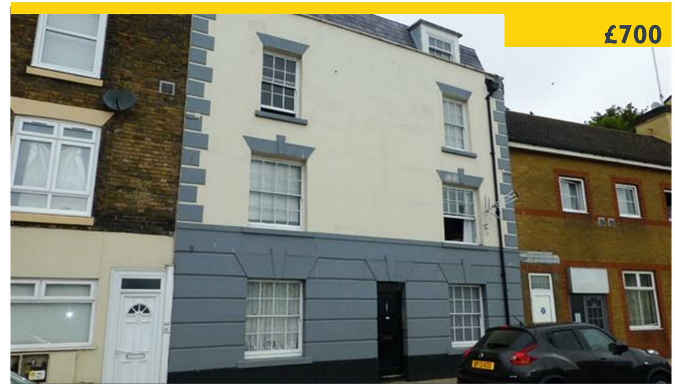
Flat 8 166 Snargate Street, , Dover CT17 9BZ

Money laundering regulations - Intending purchasers will be asked to produce identification documentation at a later stage and we would ask for your co-operation in order that there will be no delay in agreeing the sale.