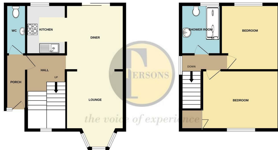
TOTAL FLOOR AREA: 843 sq.ft. (78.3 sq.m.) approx. Whilst every attempt has been made to ensure the accuracy of the floorplan contained here, measurements of doors, windows, rooms and any other items are approximate and no responsibility is taken for any error, omission or mis-statement. This plan is for illustrative purposes only and should be used as such by any prospective purchaser. The services, systems and appliances shown have not been tested and no guarantee as to their operability or efficiency can be given. Made with Metropix ©2024