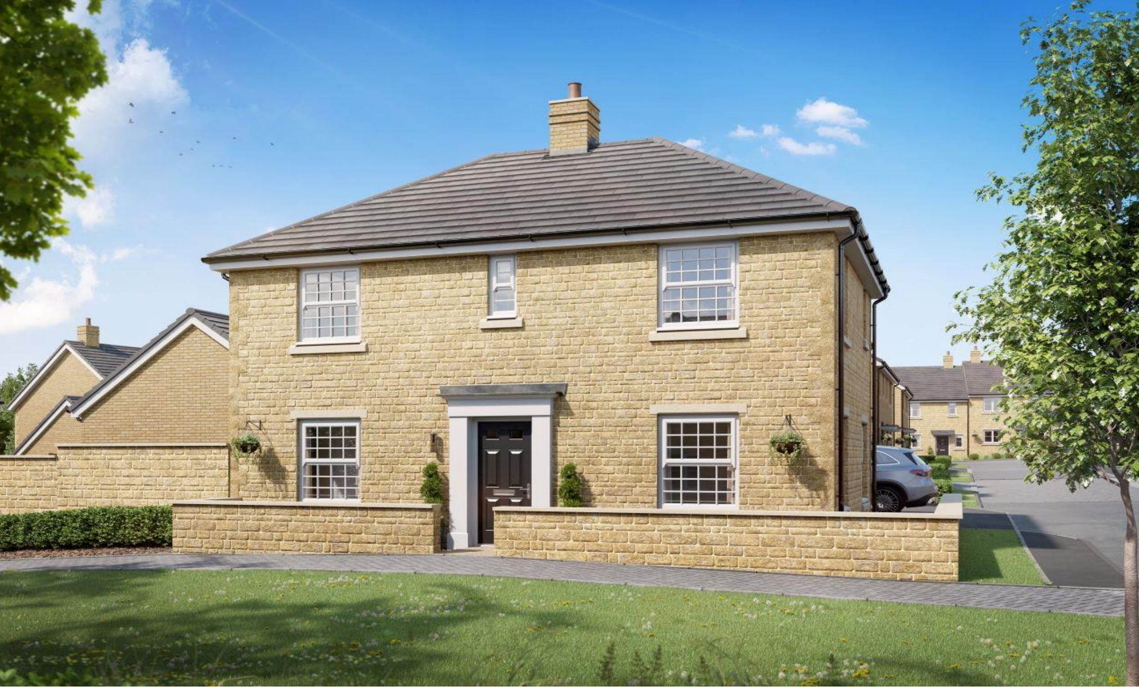
The Appleby The Crescent, Ketton Stamford PE9 3SY