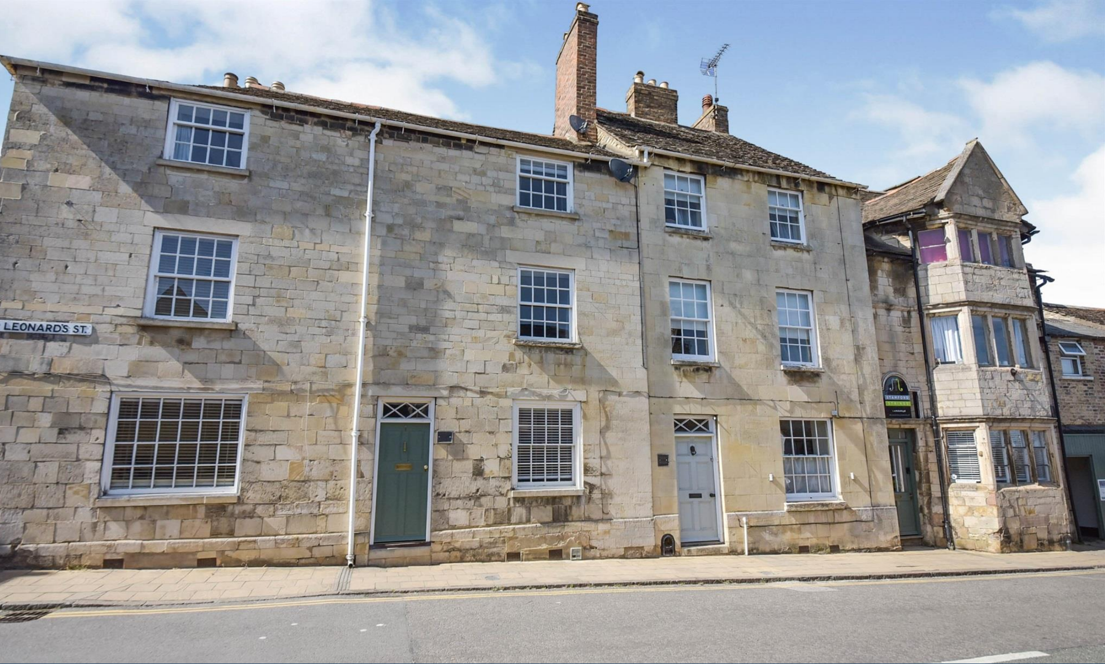
Hope House, 1 St. Leonards Street Stamford PE9 2HU