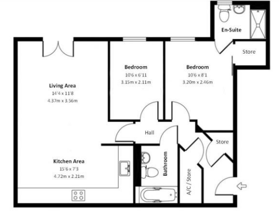
GROSS INTERNAL AREA (Approx) 657 sq.ft / 61 sq.m