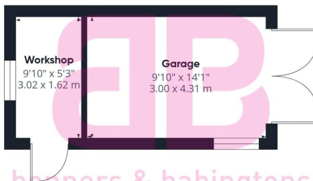
Ground Floor Building 3