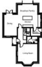
Ground floor Plot 3