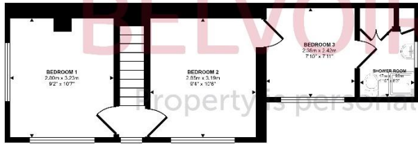
First Floor Approx 35 sq m / 373 sq ft