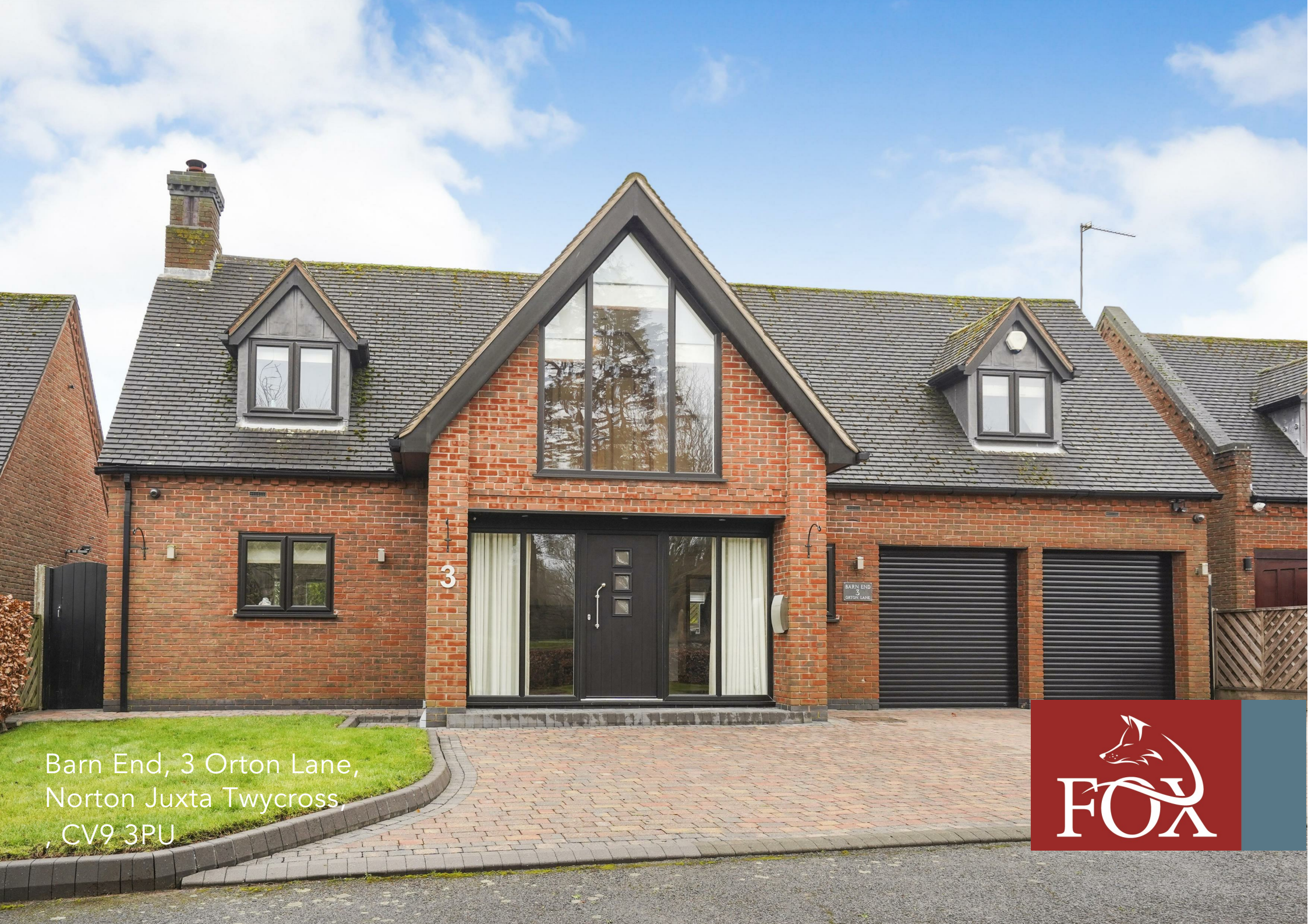
Barn End, 3 Orton Lane, Norton Juxta Twycross, , CV9 3PU