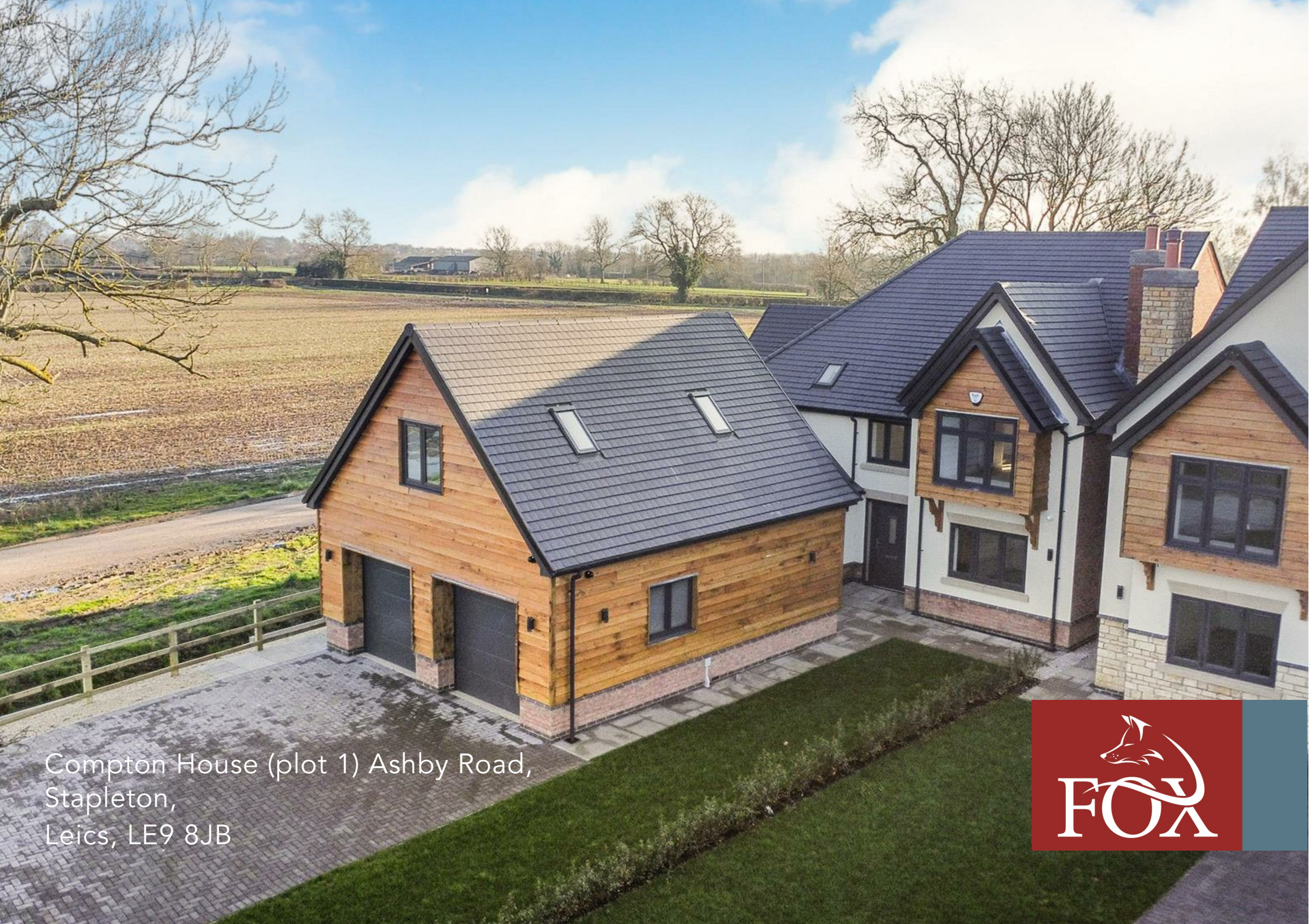
Compton House (plot 1) Ashby Road, Stapleton, Leics, LE9 8JB