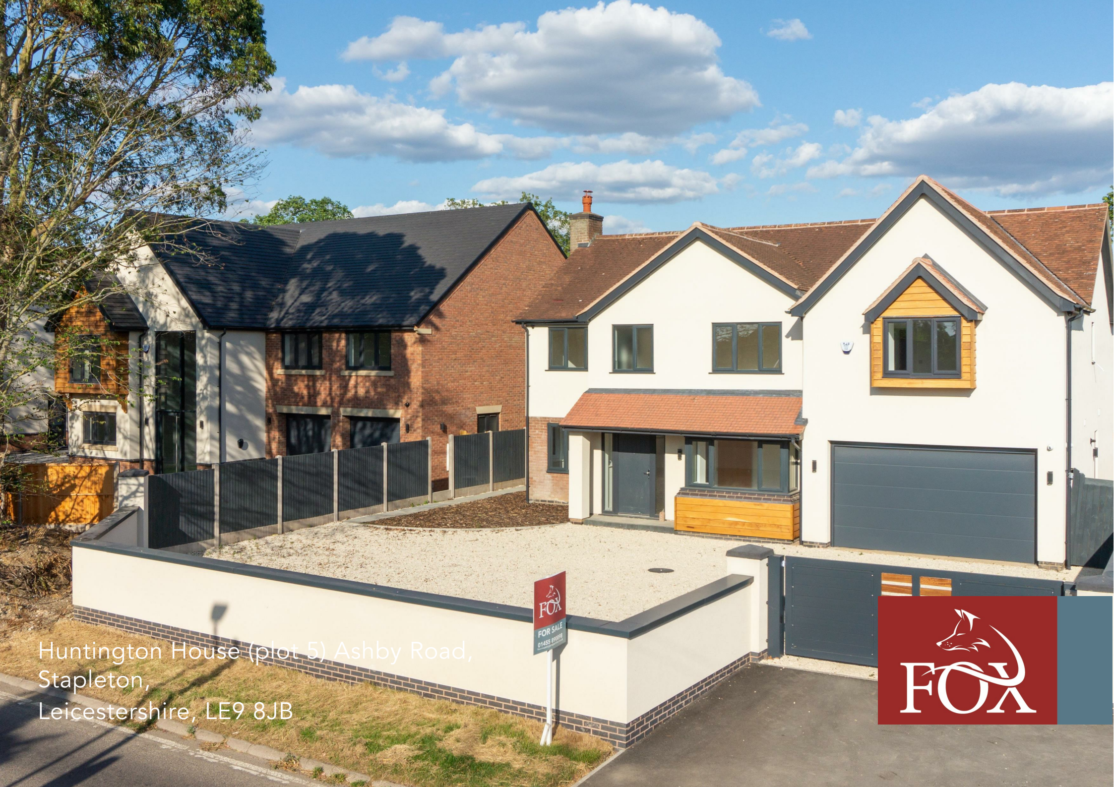
Huntington House (plot 5) Ashby Road, Stapleton, Leicestershire, LE9 8JB