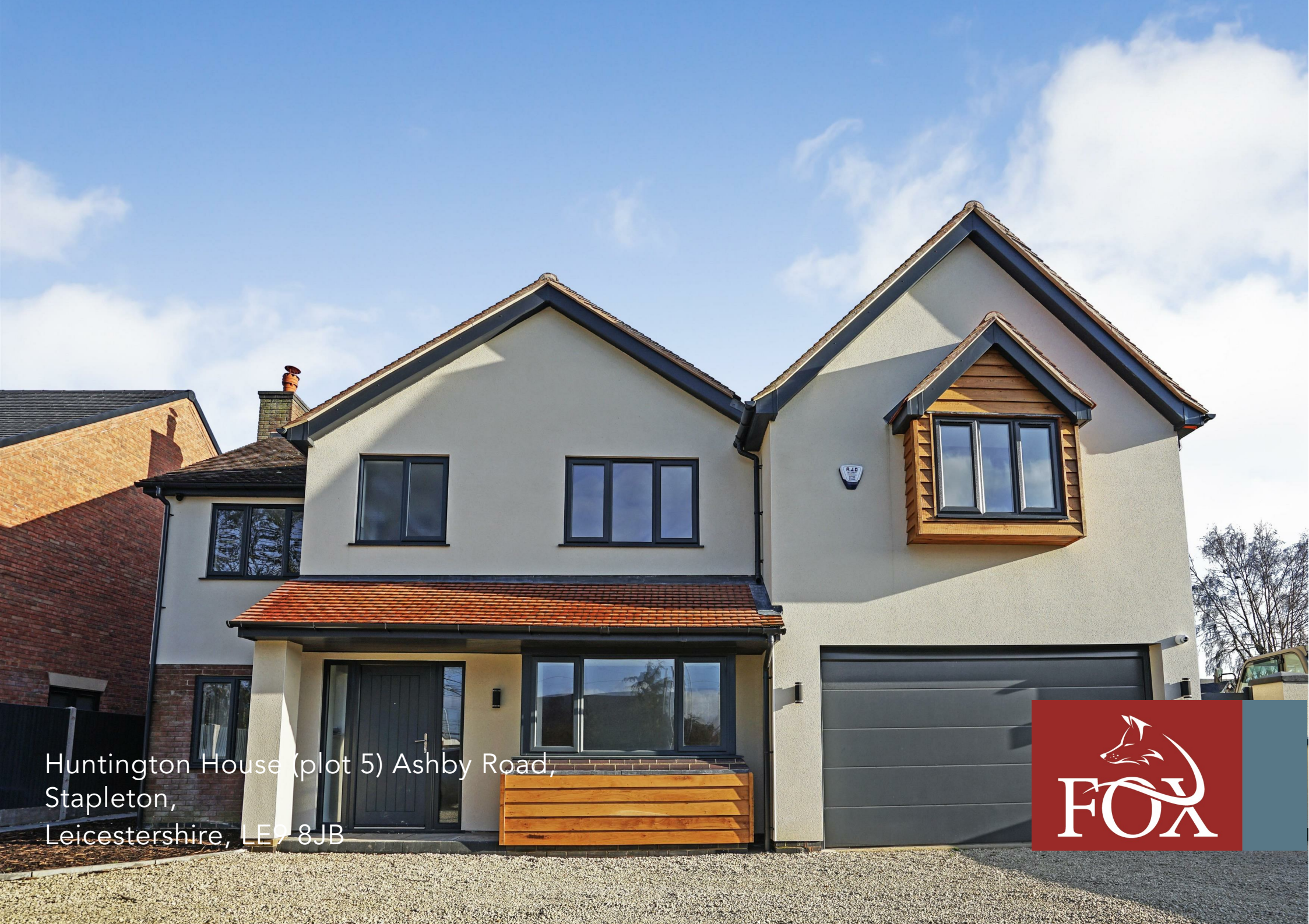
Huntington House (plot 5) Ashby Road, Stapleton, Leicestershire, LE9 8JB