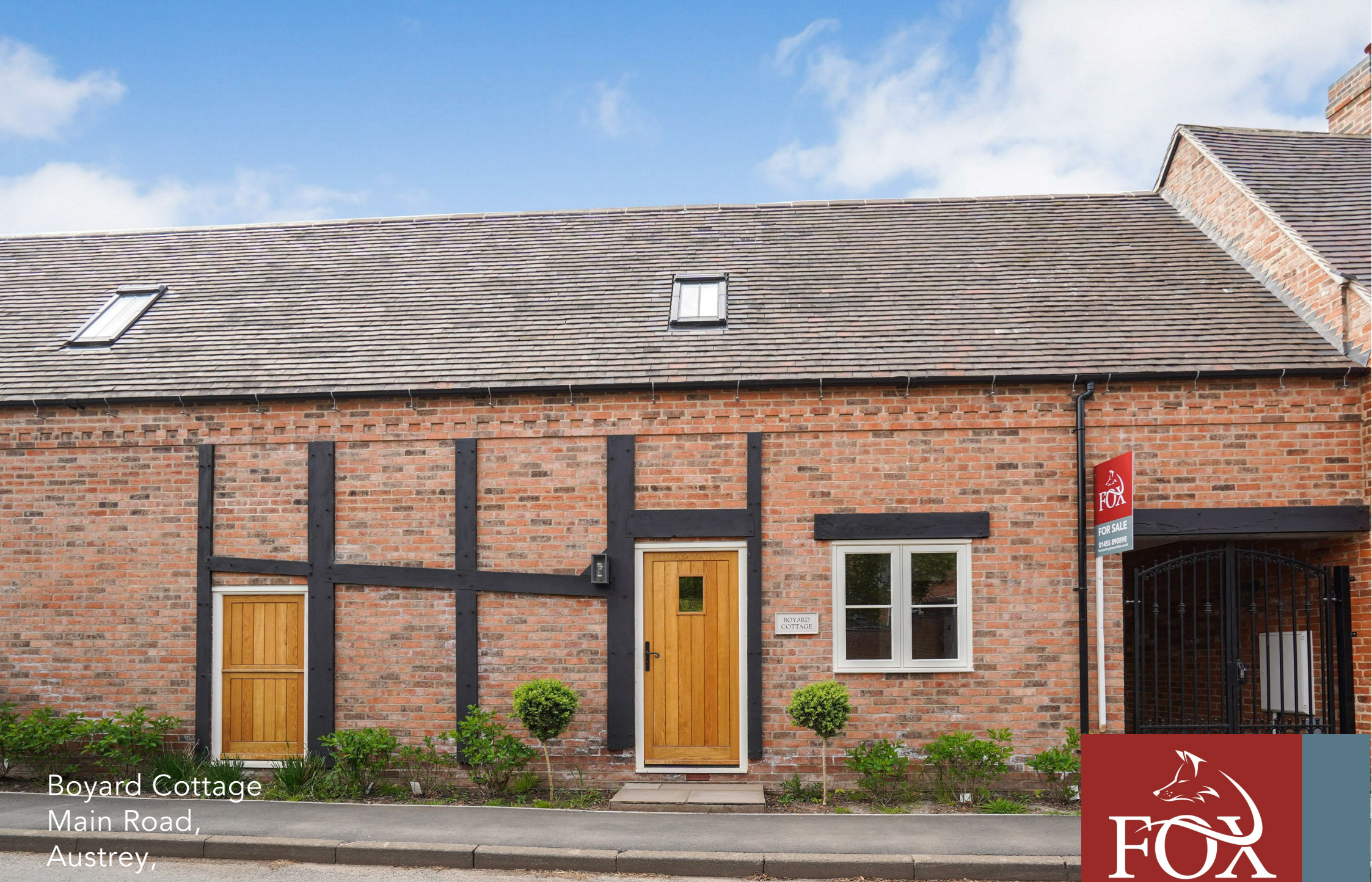
Boyard Cottage Main Road, Austrey, CV9 3EG.